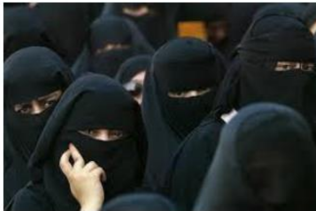
Women in Saudi Arabia do not have the right to vote