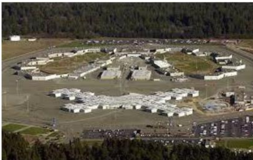
Prisons in Guantanamo Bay