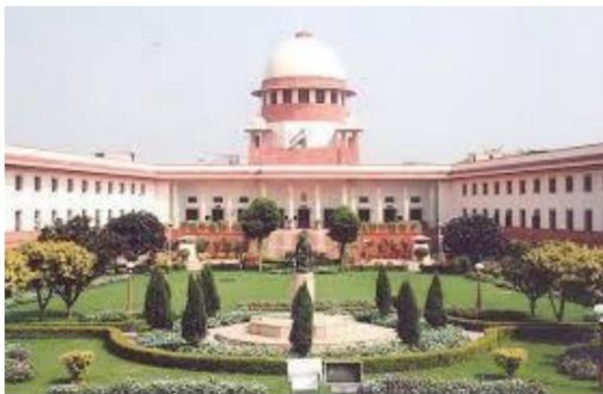
The Supreme Court of India in New Delhi

People who are not satisfied with the decision of the High Court can file cases in the Supreme Court.