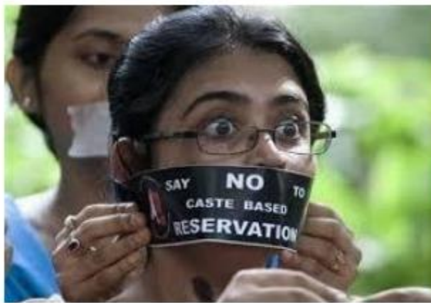
Protest against caste-based reservations