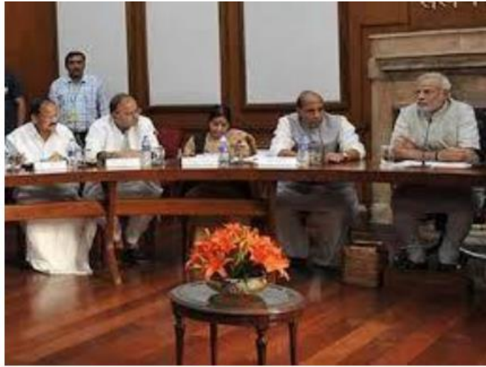
Cabinet – Inner ring of the Council of Ministers