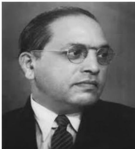
Dr. B.R. Ambedkar

The holding of elections in 1937 in all parts of British India and the passing of various Acts of the Government of India helped the Indians to gain experience in the working of legislative assemblies and drafting of the Constitution. The leaders of the country also drew inspiration from the American Revolution, French Revolution and the practice of the parliamentary democracy in Great Britain. They had also read constitutions of other countries and were inspired by features of these constitutions. This helped our leaders to frame the Constitution of the country.