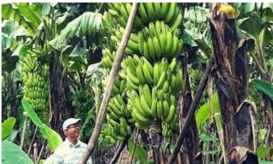
Banana plantation in Southern part of India