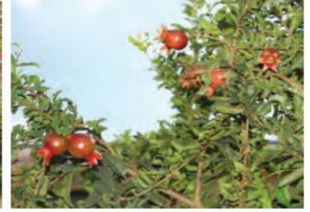
Apricots, apple and pomegranate