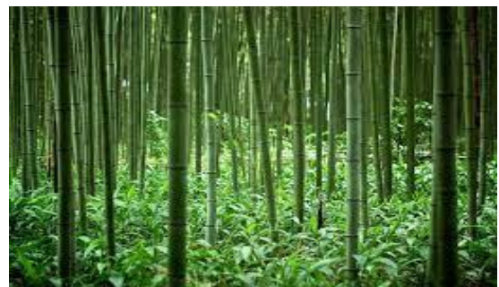
Bamboo plantation in North-east