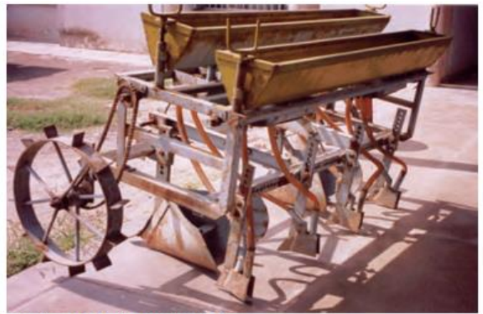
Modern technological equipments used in agriculture