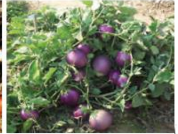
Cultivation of vegetables – peas, cauliflower, tomato and brinjal