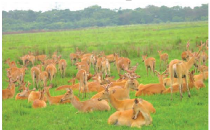
Rhino and deer in Kaziranga National Park