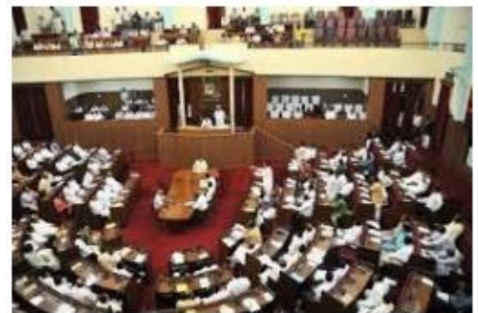
Members of the State Legislative Assembly can discuss, debate and ask questions regarding the work of the departments