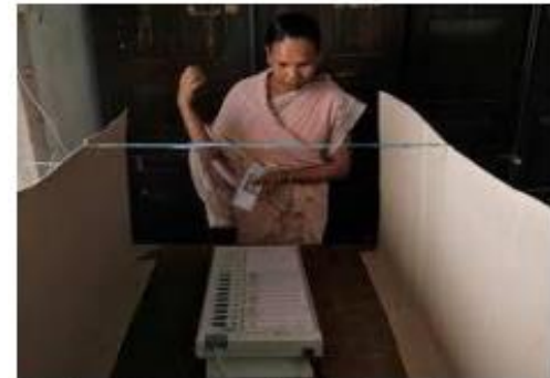
People in State Assembly Elections choose their own representatives