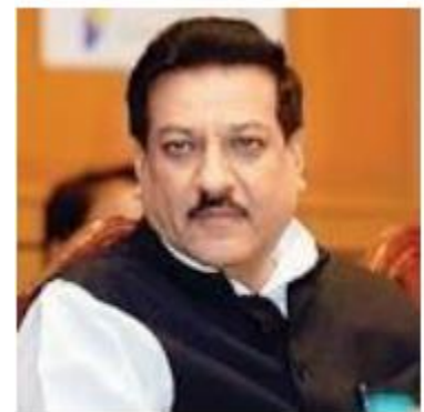
Prithviraj Chavan, besides being the Chief Minister of Maharashtra (from 2010-14) was also a MLA of Karad constituency in Maharashtra.