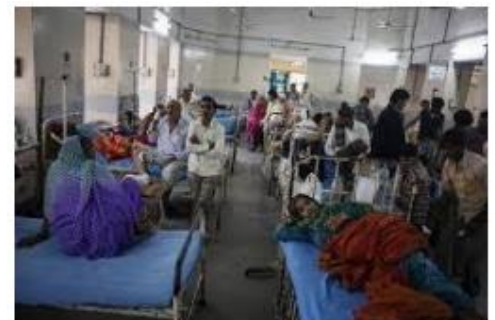
Public health care is so called as in public hospitals the cost of treatment and medicines are low. Most of the financial resources come from the taxes paid by the people.