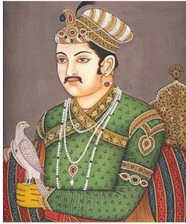
Akbar - (1556-1605)