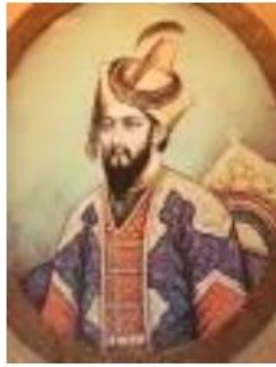
Babur was the founder of the Mughal rule in India