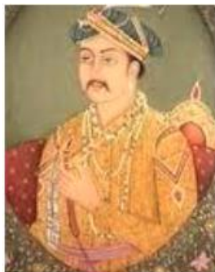
Raja Todar Mal was the revenue minister in the court of Akbar