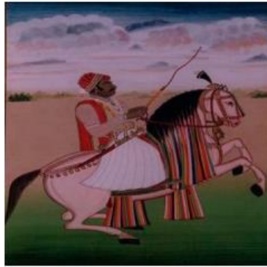
Raja Man Singh was a loyal friend of Akbar. He was a mansabdar in the Mughal court with a zat rank of 5,000