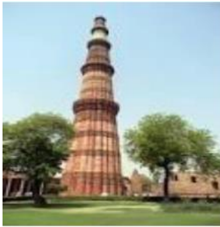
The Qutb Minar