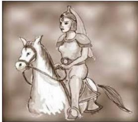
Razia Sultana, the first woman ruler of Delhi